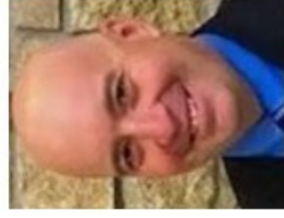
Murray Wright Newman Theological College