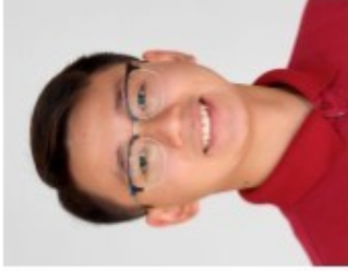
Huy Le Christ the King Seminary