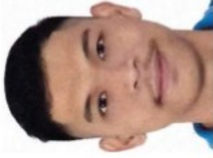
Sadale Rosillo St. Joseph's Seminary