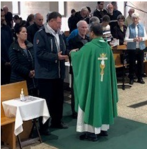
Anointing of the Sick—Feb. 11