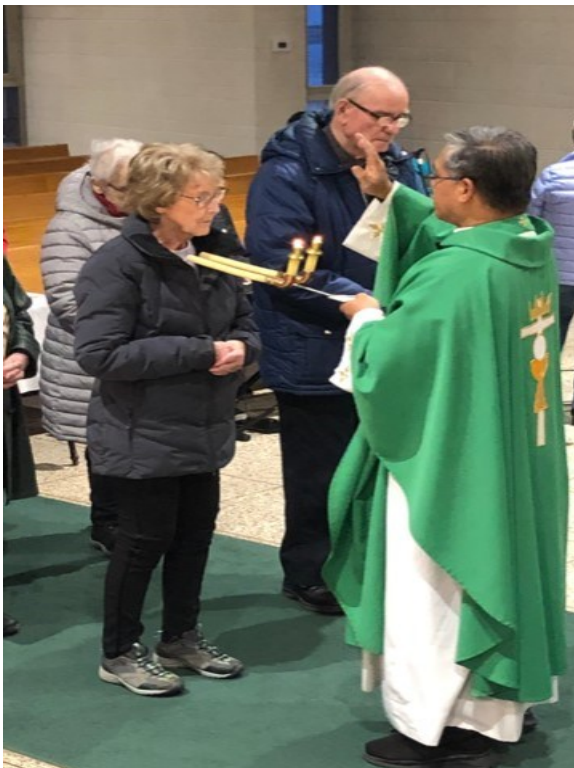
Blessing of Throats - Feb. 4

HOLY CROSS PARISH ANNUAL GENERAL MEETING SUNDAY APRIL 7 after Mass.