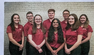
NET 2024 Traveling team

All youth from the Archdiocese are welcome